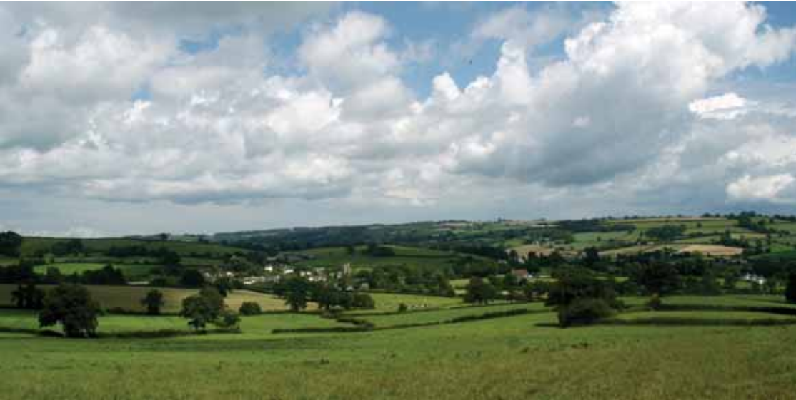
Stockland from Groundhead Road