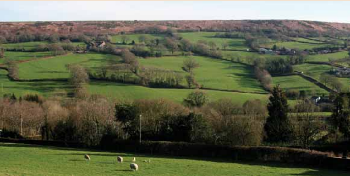
Hartridge Common from Luppitt